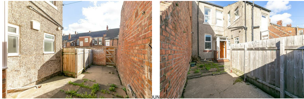
668 sq.ft. (62.0 sq.m.) approx.